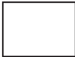
Half-Page 5" x 3.75"